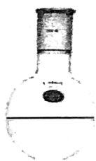
toluene - acetone

Below are two distillation flasks. The flask on the left contains a mixture of toluene and acetone. The two are miscible so they form a clear colorless solution. On the right is a mixture of toluene and water. The two are not miscible; the toluene forms a layer on top of the water, just like gasoline on water.