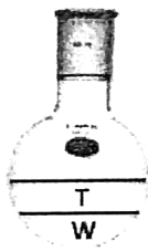
toluene - water

If you distill the toluene-acetone mixture, when the temperature of the mixture reaches 56°C the acetone, being the lower boiling of the two, will distill out of the mixture and the purified (2) acetone can be collected. Then, as more heat is applied and the temperature in the distillation flask reaches 111°C the toluene will vaporize and can, likewise, be collected. This mixture behaves just as you'd expect it to.